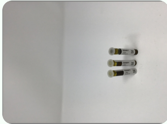
The photos on this report are of a sample collected by the lab and may vary from the final packaging.